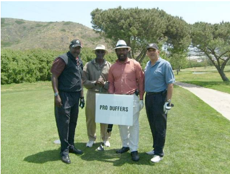
Pro Duffers West supporting The REACH MORE Foundation Fundraiser

Check out produfferswest.org for more details